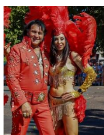
Recognise these people?